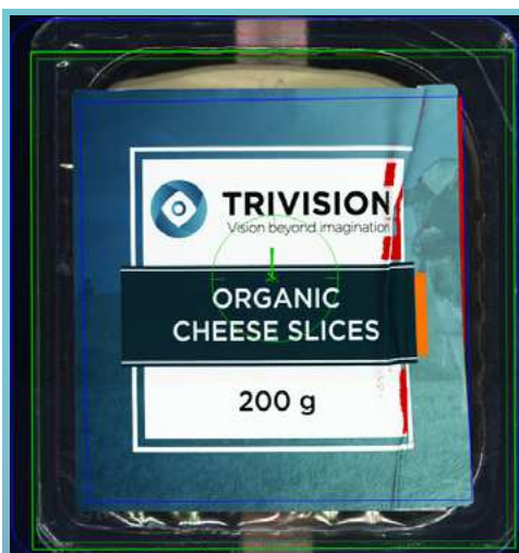
Wrinkled labels / incorrect artwork

VisioCompact® reliably and accurately detects errors exceeding the set desired quality level. Following examples show some of the errors that VisioCompact® detects and rejects.