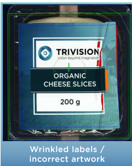
Wrinkled labels / incorrect artwork